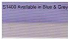
S1400 Available in Blue & Grey