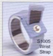
S1005 Wrist Strap